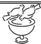
Christian Meditation Ireland

Planned Giving Weekly Envelope Collection: 20th December: € 2216.50 27th December: € 1445.72 3rd January: € 1760.36